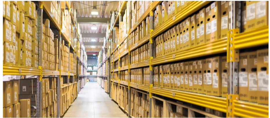
European spare parts warehouse